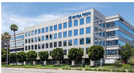
HQ of perennial No.1

Several of these are recognizable to OCers, not least because their names— Tetra Tech and Aecom for instance—grace buildings facing local roads, freeways and construction which, in a nice twist, might involve projects the firms are involved with.